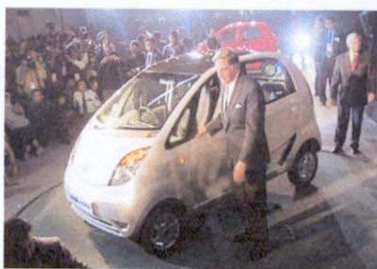
Tata and Kelly presenting the Nano for India, Geneva Car Exhibition, 25 th March 2009